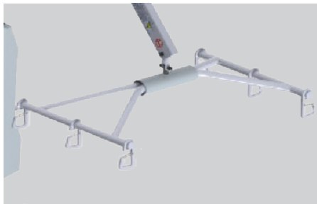
The Titan's 6-point spreader bar and our wide variety of bariatric slings available provides safety & comfort for any patient.